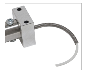
Sensor attachment Bending protection