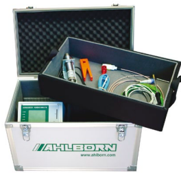
ZB 5600 TK3