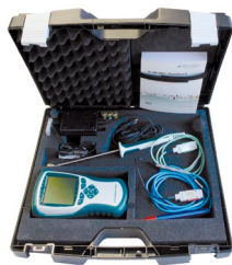
ZB 2490 TK2