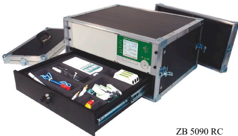
ZB 5090 RC