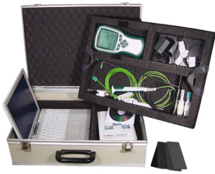
ZB 2590 TK2