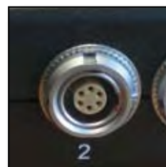
Input Connectors Highest quality latching metal 'Lemo' connectors.