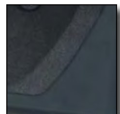
Rubber Sleeve The TTI-10 Handheld Thermometer is supplied with a protective rubber boot.